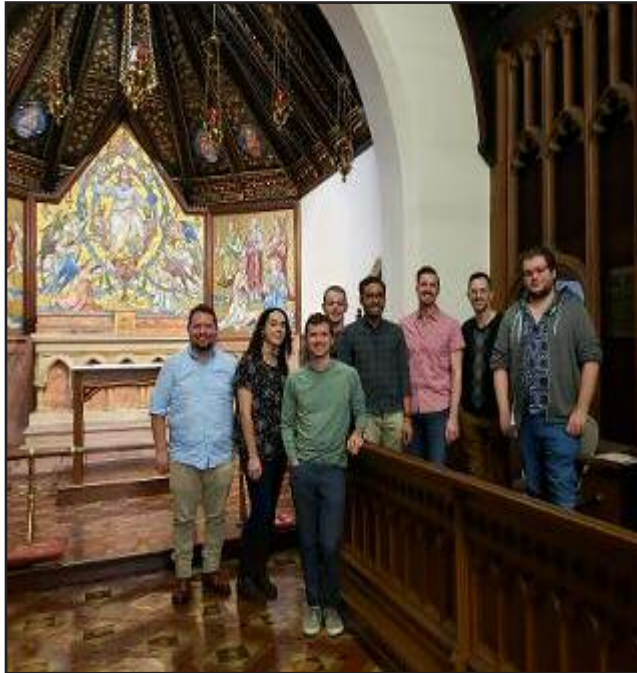
The entire group

We had lasagna and salad, talked and laughed, and then explored the organ... talked and laughed!